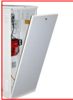
Front access door for burner, electrical equipment, room thermostat and oil filter