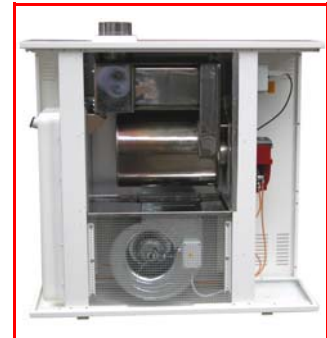
Quick accessibility with all the components for an easy maintenance (5 to 10 minutes to reach the fan and the combustion chamber)