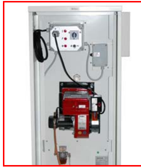
Combustion and electrical compartment