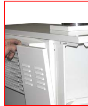
Fixing of the panels by inserts in order to facilitate the access and to avoid any external screws and bolts