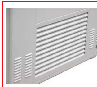
Air external inlet anti-rain grid. Can be fitted on left or right side of the heater.