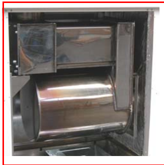
Stainless steel combustion chamber with high efficiency heat exchanger