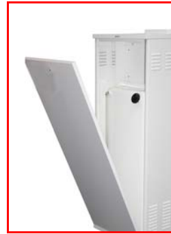
Back access door for oil integrated tank with gauge