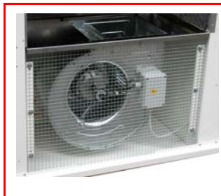
High pressure centrifugal fan silencers - IP55 Equipped with grid