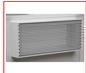
Warm air output grid with automatic non-return valve. Can be fitted on left or right side of the heater.