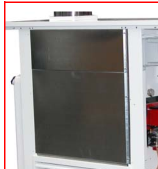
Double steel plate for thermo-acoustic insulation and to maintain the panels external cold, thus removing any risk of burns